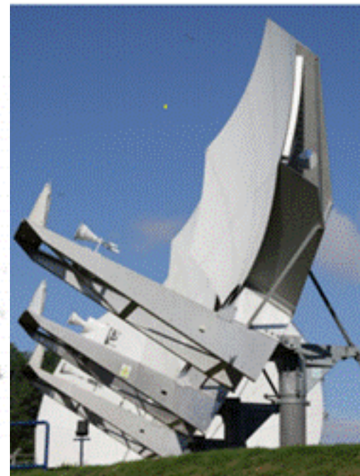
Satellite Mediaport Services' combined C-Ku- and Ka-band service footprint from Rugby, UK.